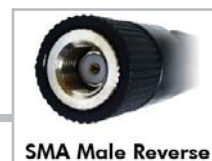
SMA Male Reverse