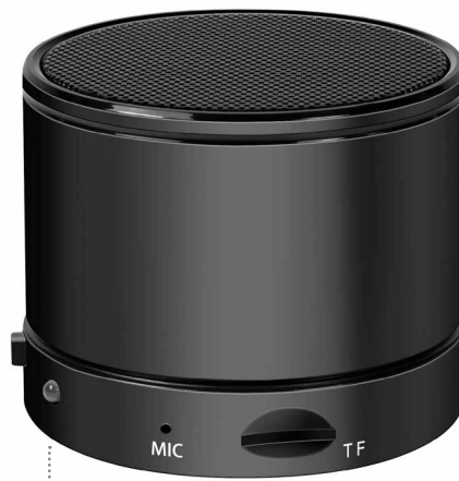
LED Indicator Microphone microSD Card Slot

Listen to the latest music or news through FM Radio.