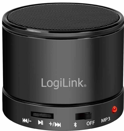
Audio Controls Mode Switch