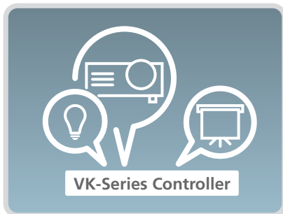
1. Connect hardware