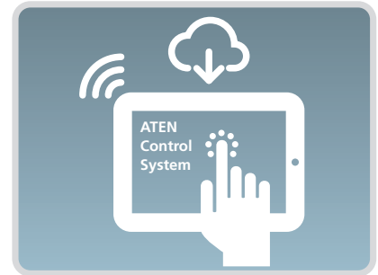
3. Download app