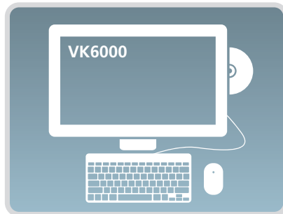
2. Configure settings