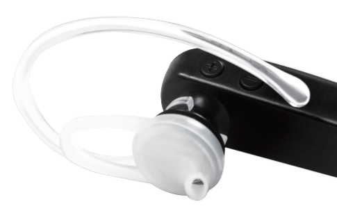
Stay in your ear and never fall out!