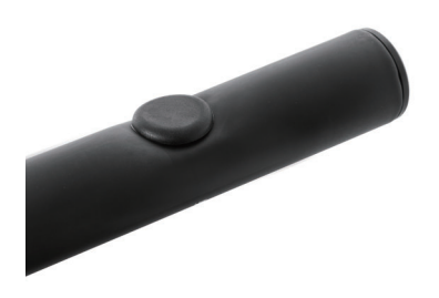
Non-skid rubber pads