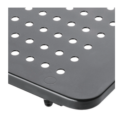
Increase air circulation