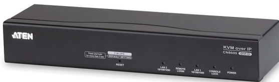
CN8600 Front view