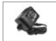
Power Adapter:DC5V x 1