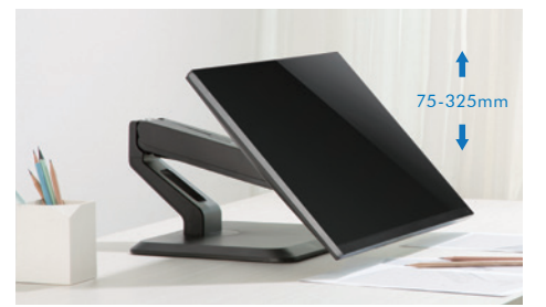
Ergonomic Design Hight adjustment for the desired viewing angle.