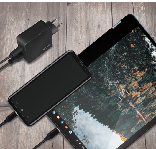
Rapid Charging with PD3.0 and QC3.0

Portable designed for fast charging dual devices simultaneously, perfect for traveling.