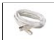
UC-210T 1.8m USB2.0 Cable x 1