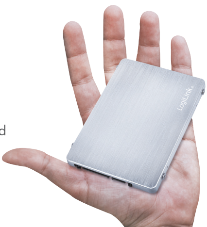
Lightweight and Compact