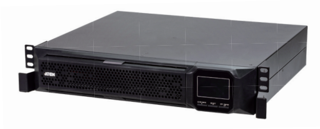
OL1000LV Front View