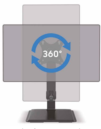
Landscape or portrait orientation

Enjoy a variety of angles to face the screen in the direction, the position and the height you want at any given time.